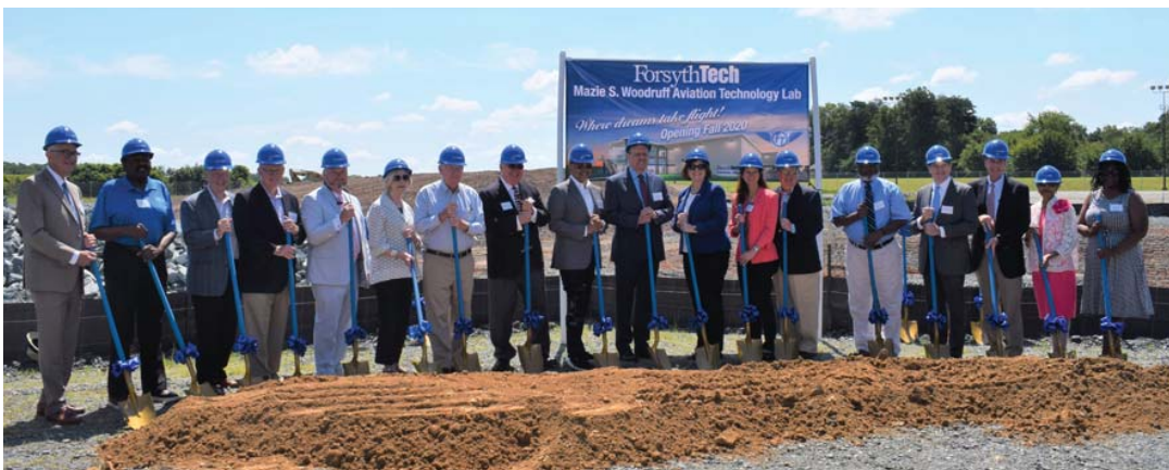
Ground was broken on Forsyth Tech's Aviation Technology Lab on July 24.

approved in 2016 after county commissioners voted to place it on the ballot. The aviation lab will prepare students for jobs in Maintenance Overhaul and Repair (MRO) needed by aerospace companies at Smith Reynolds Airport and around the state. The county plans to partner with Carver High School to encourage students who live near the airport to enroll in the program.