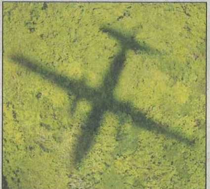
The shadow of the Golden Knights C-31A Troopship skims the landscape.