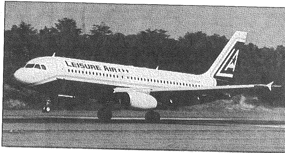
Leisure Air, unlike many charter companies, has new jets, three Airbus A-320s.

Hot face towels and flight attendants trained to be gracious and warm await passengers who climb aboard any of Leisure Air's three jets that fly from Boston or Detroit to Atlantic City, Las Vegas and Caribbean vacation spots. And, of course, passen-