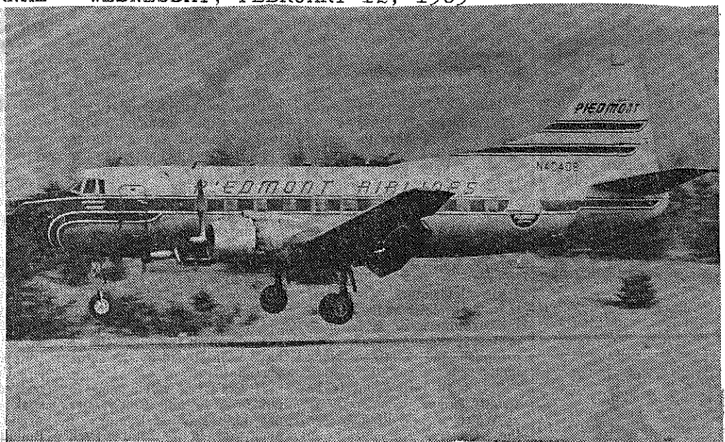
Coming in for an emergency landing, Piedmont plane touches down on left landing gear to reduce impact on right gear with one wheel missing.